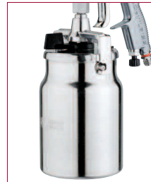
Suction cup pt. no. TGC-545-E-K

Advance HD spray guns kits are packaged as:- Pressure gun only, Suction gun with 1 litre cup and Gravity feed kits inc. 568 ml standard gravity cup.