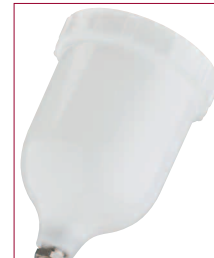
Gravity cup pt. no. GFC 501