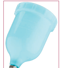
Gravity cup (Blue polyester) pt. no. GFC 511 for difficult fluids.