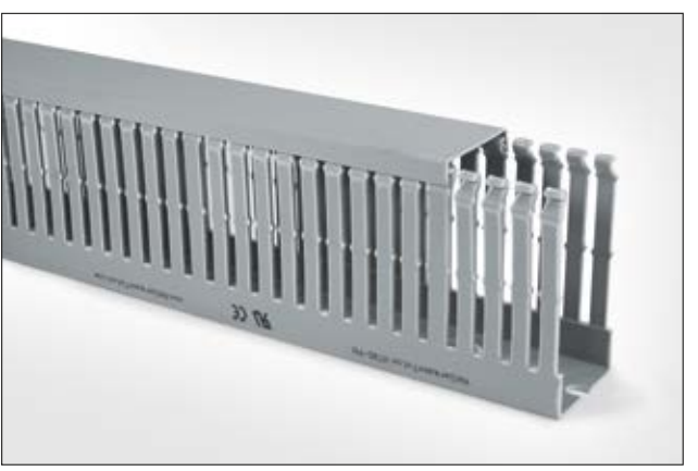
HelaDuct HTWD-PN - narrow finger wiring duct.