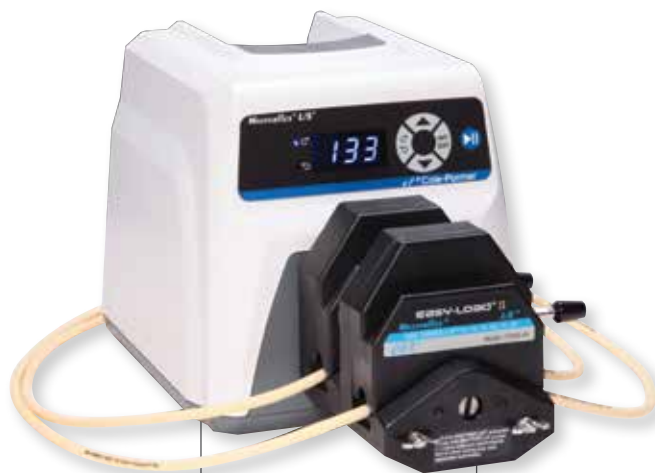
Stack up to 4 heads to maximize productivity in less space

Flow Rates in mL/min (flow rates in parentheses can only be obtained with the High-Performance pump head—at ColeParmer.com)