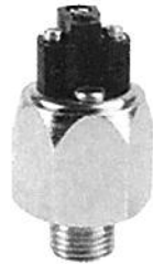
without protective cap

Width across flats 24 Height 40 Length of thread 9