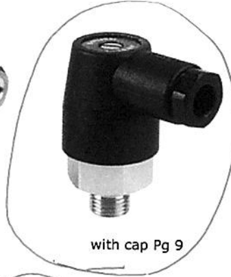
with cap Pg 9