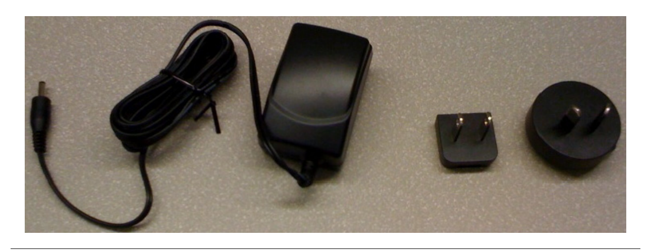
Figure 2. FSU Power Supply

The external power supply is rated for 110-240 VAC, 50/60 Hz. It is an optional unit except when using the FSU in high power mode. The male end of the power-supply connector is user-configurable.