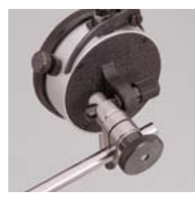
Left: 657AA with 711FS Last Word® Dial Test Indicator Above: 657AA with 196B1 Universal Dial Indicator Above Right: 657Y with lug-on-center back