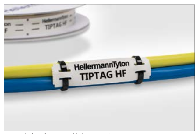
TIPTAG - high performance cable bundle marking.