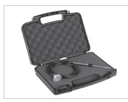
Helium sniffer line SL 301 in transport case